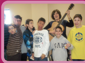
DANCE & MOVEMENT Strengthening motor skills while having fun