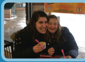
LASTING FRIENDSHIPS Meaningful friendships that will last forever