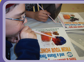
ART CENTER with sensory station and hands-on crafts