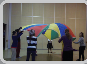
GAME & SPORTS Social and play skills