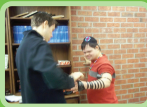
JEWISH CULTURE Aleph Bet, Torah stories, holiday songs, & skits

Our two hour Sunday Circle provides a warm and caring setting for the children, while instilling an appreciation for the Jewish heritage.