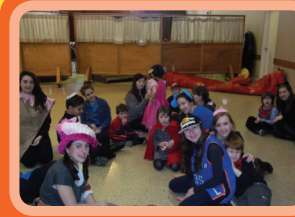
CIRCLE TIME Stories, Music & Drama